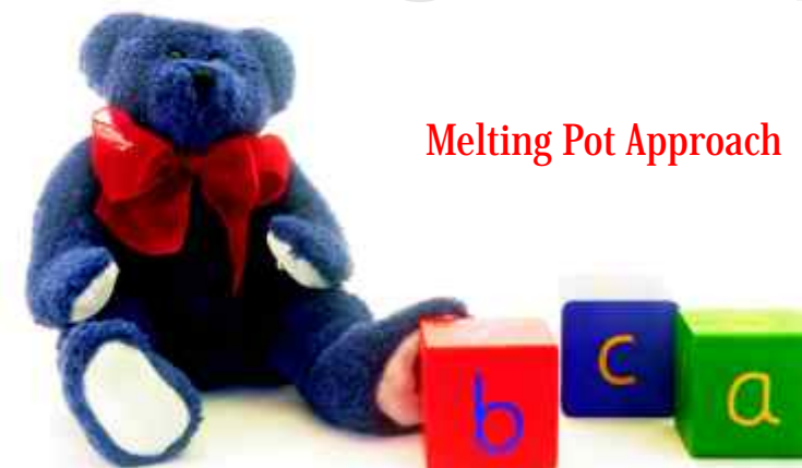
Melting Pot Approach